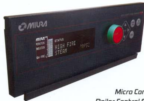
XJ1 Micro Computer Boiler Control System